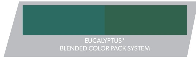
EUCALYPTUS* BLENDED COLOR PACK SYSTEM