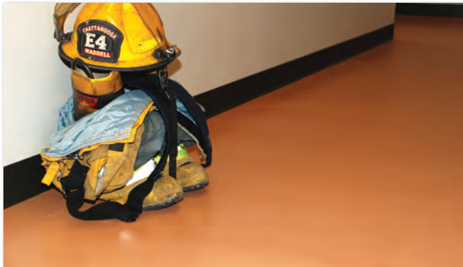
Solid Color Floor

Delivering exceptional performance in demanding environment's, this colored topcoat will withstand repetitive abuse to wear and scratching, lowering maintenance costs.