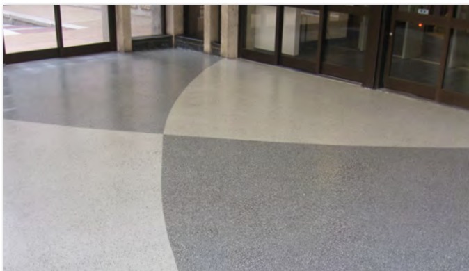
Epoxy Flake Floor