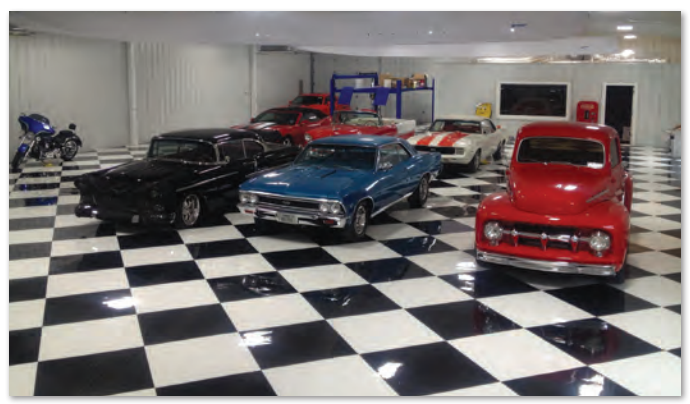
Solid Color Resinous Floor

Formulated to penetrate the pores and capillaries of concrete to generate mechanical interlock and superior bonding. DK 700 exceeds the performance of traditional epoxy primers.