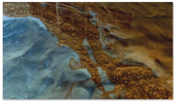
Epoxy Metallic Floor