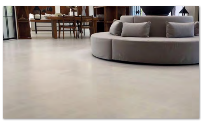
Interior Concrete Overlay